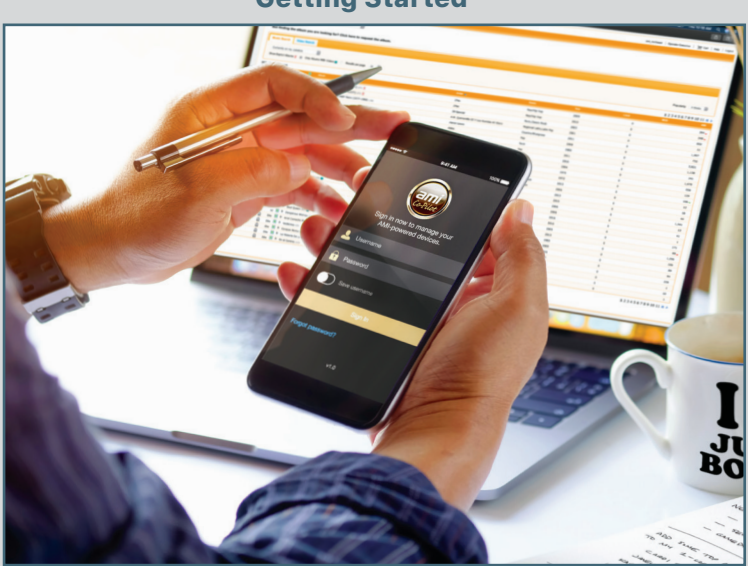
Open your Co-Pilot app, sign in, and click on the Ad Mgr icon at the bottom of the screen.